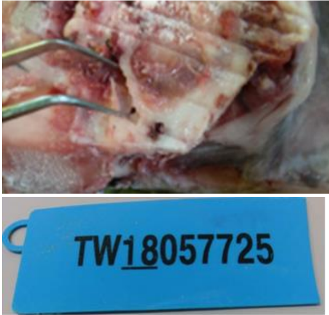
Figure 3. A SBT head section that contained the basi-occipital plates. The sagittal otolith has been removed from the otic chamber pointed by the forceps. A plastic tag printed with the ID number of the fish was used to find out the biological and sampling information from the database.