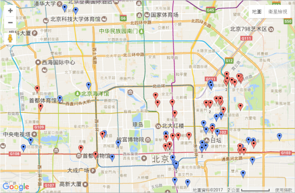
Figure 2. Locations of restaurants in Beijing for sashimi tuna sampling