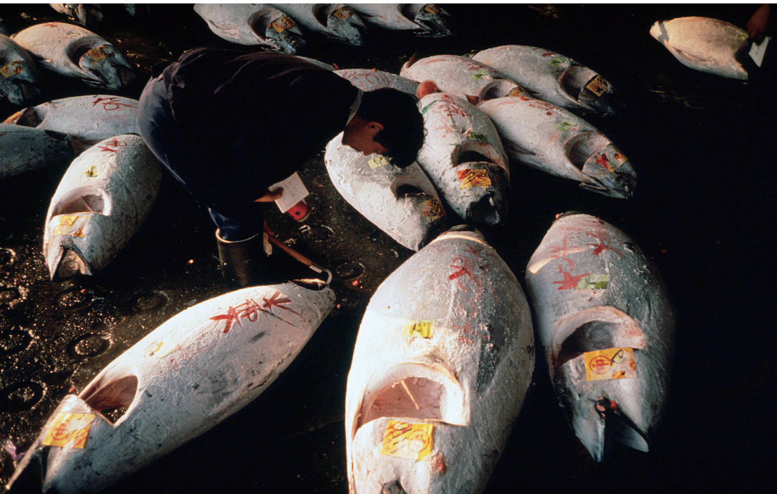
Marked and labelled Southern Bluefin Tunas Thunnus maccoyii. Tokyo fishmarket Japan