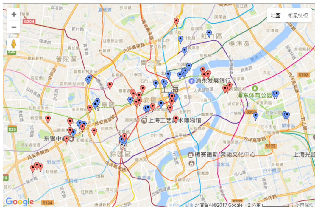
Figure 1. Locations of restaurants in Shanghai for sashimi tuna sampling

DNA profiles consisted of information collected from 5,000 SNP loci for each individual. Genetic distances (i.e. percent difference between two individuals) were calculated for pairwise comparisons of all collected samples as well as comparisons to DNA profiles from control samples of known eight Thunnus and Skipjack Tuna species previously genotyped by CSIRO. Sequencing artefact errors on the Illumina sequencer occur at 1% or less frequency and thus individuals with less than 1% differences were considered to be samples of the same individual. Percent sequence differences of 2–3% were considered conspecifics and assigned the identification of the matching control species (Davies et al. , 2016).