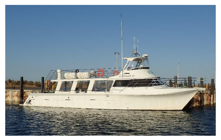
Figure 1. Latitude 22, used for the 2019 survey.