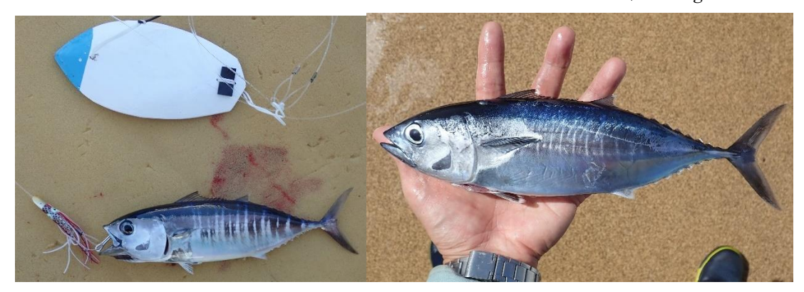
Figure 3. Southern bluefin tuna individual caught in 24.4 cm fork length.