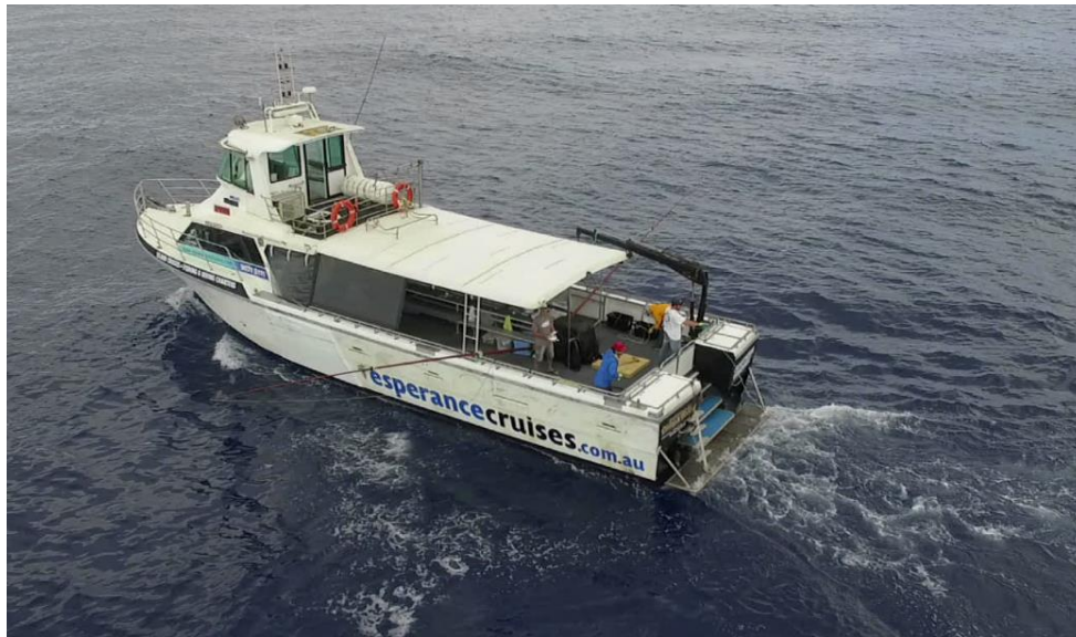
Figure 1 The Southern Conquest, used for the 2023 trolling survey. Photo was taken in 2018.