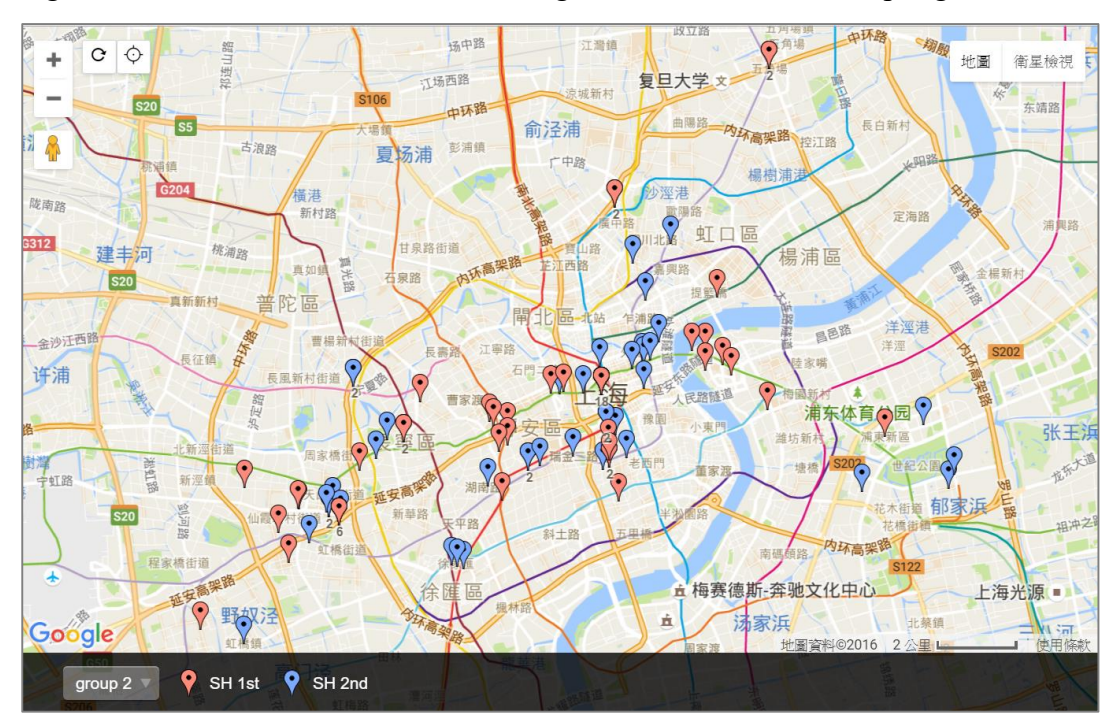
Figure 1. Locations of restaurants in Shanghai for sashimi tuna sampling