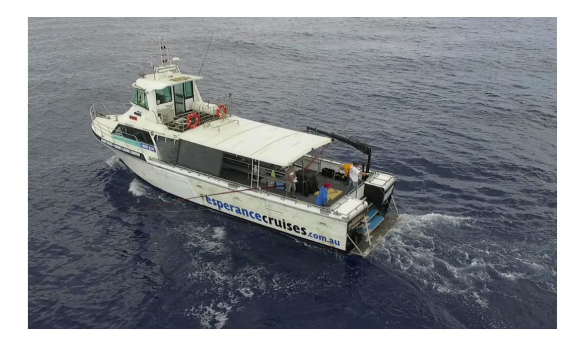
Figure 1 The Southern Conquest, used for the 2021 survey. Photo was taken in 2018.