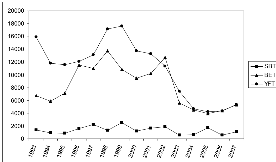
Figure 1. The estimated catch of southern bluefin, bigeye and yellowfin tuna landed at Benoa in the years 1993 to 2006.

Indonesian ports in search of better catches and staying at sea for up to 3-5 months (compared to 1-2 months previously) and carrier/collector vessel activity has increased significantly. Although the target species of Indonesia's longline fleet are primarily yellowfin (YFT) and bigeye (BET) tunas (Table 1), the catch of many of these vessels includes southern bluefin tuna (SBT). The amount of SBT catch is relatively small compared to that of YFT and BET, but is significant, as the majority are caught from the only known spawning area for this species, south of Java and Bali (Fig. 2). Long term declines in average size and age of SBT caught by this fishery, and also declines in catches of YFT and BET (Fig. 1), are of serious concern. To better understand the reasons behind these trends, and to assist development of effective management strategies for fishery sustainability, obtaining catch and effort data was identified by all the collaborating organisations and stakeholders as an urgent priority.