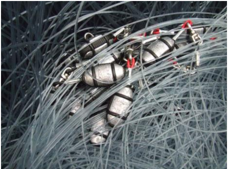
Figure 1. Branch line bin of the F/V Samurai as used in the 120 g trial (left). Clips (one end of the branch line) are attached to horizontal runners around the top of the bin and hooks (the other end of branch lines) are suspended from the clips. The branch lines joining clips and hooks are coiled in the bin along with the line weights. Some branch lines shown are fitted with sleeves adjacent to the hooks. The yellow cable ties shown were attached for the trial and are not a normal part of the fishing gear. The weights in the photo on the left are 60 g safe leads. The 120 g 'safe' leads weights used in the trial are shown in the photo on the right.

The variables recorded on each weighting regime during line sets were time of deployment of radio beacons associated with each group of 200 hooks (allows estimation of the time lines were in the water fishing). The variables recorded during line hauling were the taxa of all fish caught, time of landing, fate, life status, length and sex.