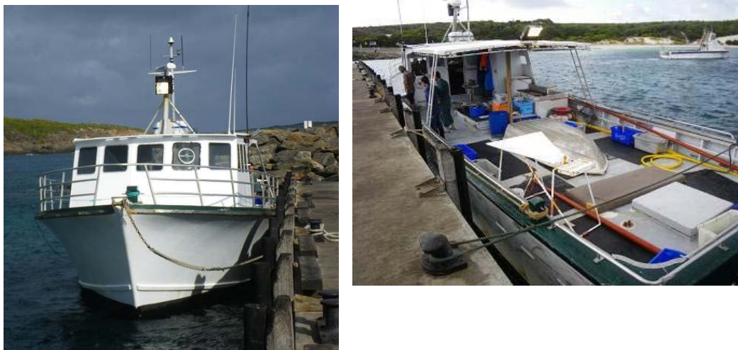
Figure 1 St Gerard M, used for the research