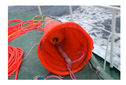
Figure 15. Modified road cone with 1.7 kg weight as a tori line towed device.