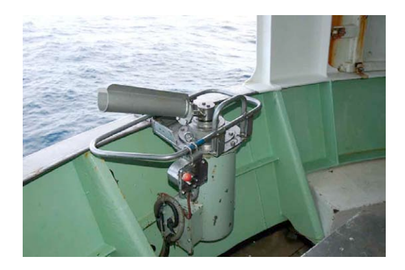
Figure 1. Bait casting machine.