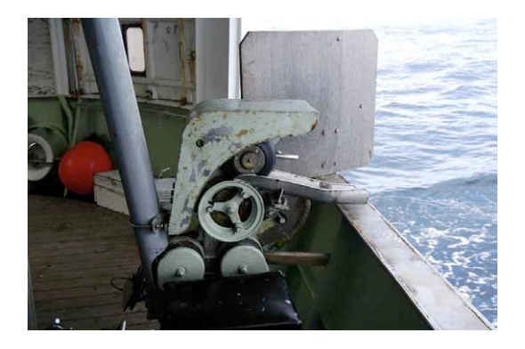
Figure 2. Lineshooter.