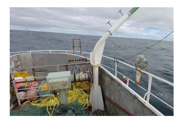
Figure 6. Port tori pole davit and winch.