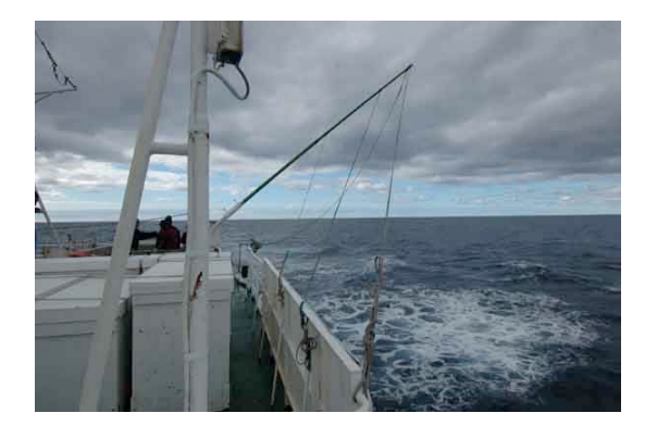
Figure 7. Port tori pole