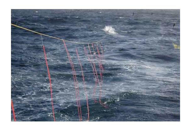
Figure 10. Alaskan tori line.