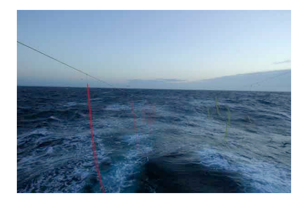
Figure 11. Alaska tori line (left) and joint venture vessel tori line (right).