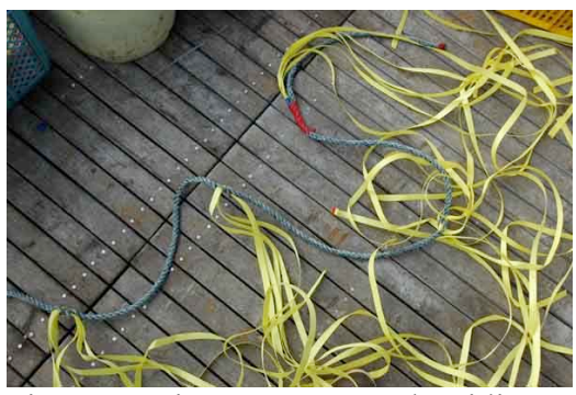
Figure 9. Joint venture vessel tori line streamers.