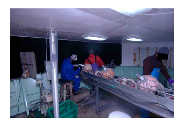
Figure 3. Setting longlines.