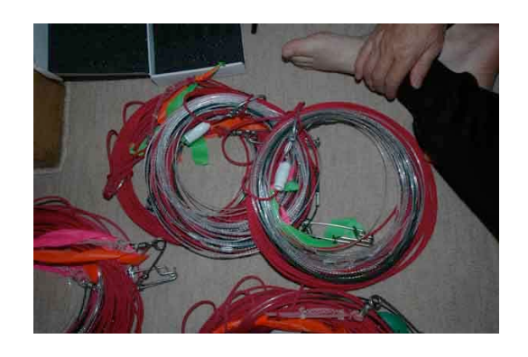
Figure 14. Star-Oddi TDRs taped to branchlines at the hook.