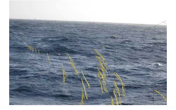
Figure 6. Tori lines.