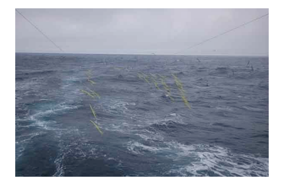
Figure 5. Tori lines.