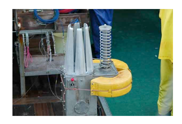
Figure 4. Line coiler