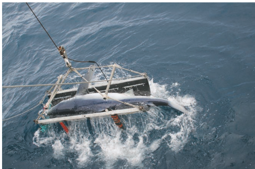
Blue shark ( P. glauca ) released with a satellite tag fitted during a National large pelagic research survey aboard the RV Ellen Khuzwayo

The South African prawn trawl fishery operates in shallow water (<50 m) around the Tugela Bank (KwaZulu-Natal), and in deeper water (300-500 m) between Cape Vidal and Amanzimtoti. Catches (by mass) of the prawn fishery consist of roughly 20 percent target species, 10 percent retained by-catch and 70 percent discarded by-catch. Chondrichthyans are mainly discarded, with the exception of squalid at times. The trawl vessels employed in the fishery tend to be small (24-33m length), and use 50mm stretched cod-end mesh nets. Shallow water chondrichthyan by-catch include