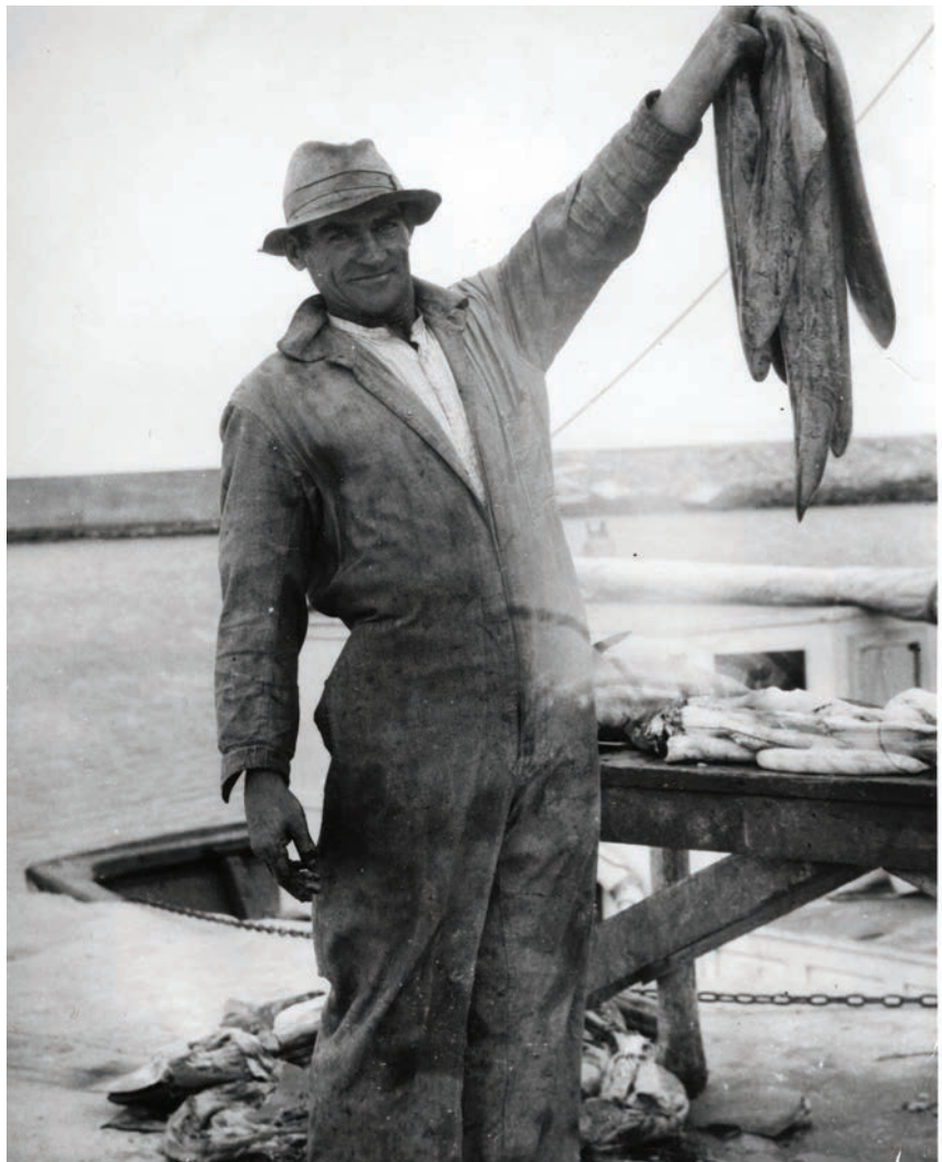
Fishermen holding shark liver to be used for the production of vitamin A