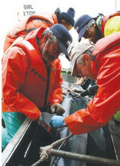
Blue shark ( P. glauca ) one of the most commonly caught shark in the large pelagic fishery being tagged with a satellite tag during National research surveys aboard the RV Ellen Khuzwayo