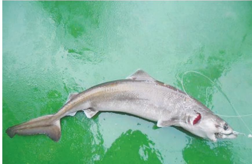
Crocodile sharks ( Pseudocarcharias kamoharai ) are caught occasionally by tuna longline vessels and are usually released

are required to be completed by set. Shark catches are considered small, but there is concern regarding the identification of shark species and the impact the fishery could have on species that are long-lived and sensitive to fishing pressure. Hence, protocols for shark release procedures are needed and require enforcement.