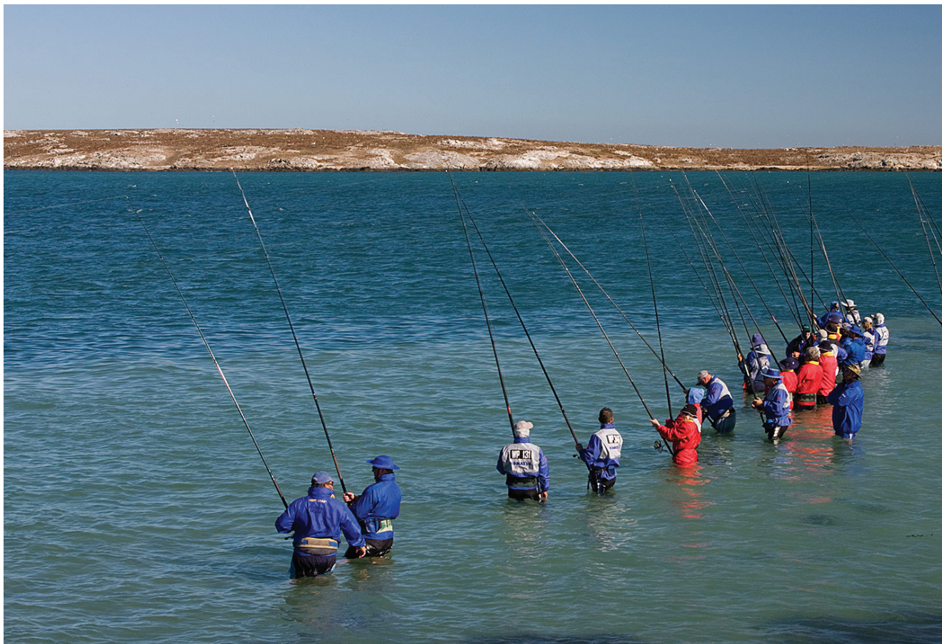
Recreational fishers competing in an angling competition in the Langebaan Lagoon