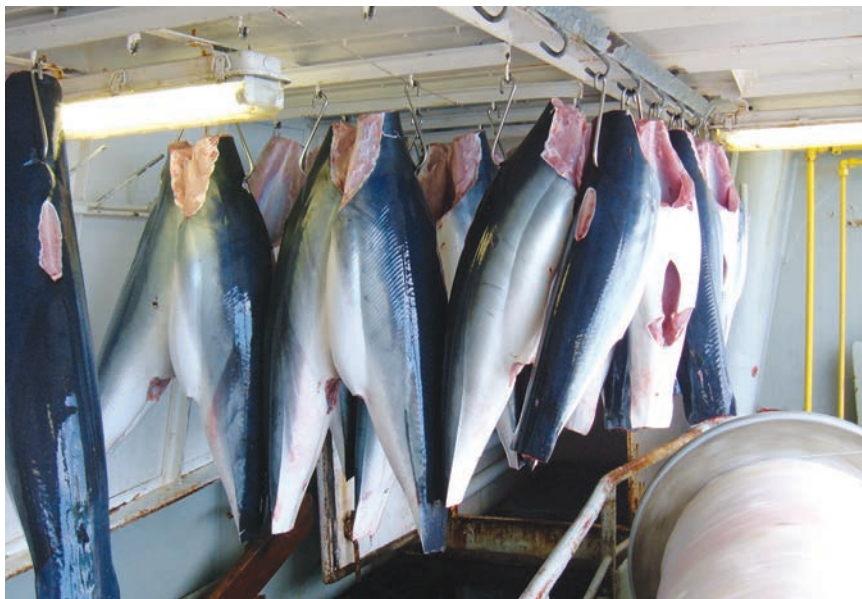
Shortfin mako sharks I. oxyrinchus being prepared for market aboard a tuna longline vessel

of the tuna/swordfish fleet. In addition foreign charter vessels are restricted to a 10% shark by-catch limit and these vessels have 100% observer coverage. Observer coverage was targeted at 20% for domestic vessels, but due to the expiry of the observer contract with the service providers no observer coverage could be obtained for domestic vessels during 2011. Observers typically record species composition, length frequencies, live releases, and discards. All vessels in this fishery are monitored by VMS. All landings are weighed and independently monitored. Logbooks are required to be completed on set-by-set basis. All fisheries data pertaining to pelagic sharks are submitted to ICCAT and IOTC on an annual basis but South Africa's capacity to send experts to RFMO scientific meetings is still a concern. Shark finning is banned in terms of permit conditions. Landings of certain shark species are banned due to concern over their conservation status namely, silky sharks, oceanic whitetip, all thresher sharks, and all hammerhead sharks. The correct identification of some shark species by fishers and MCS personnel remains a challenge.