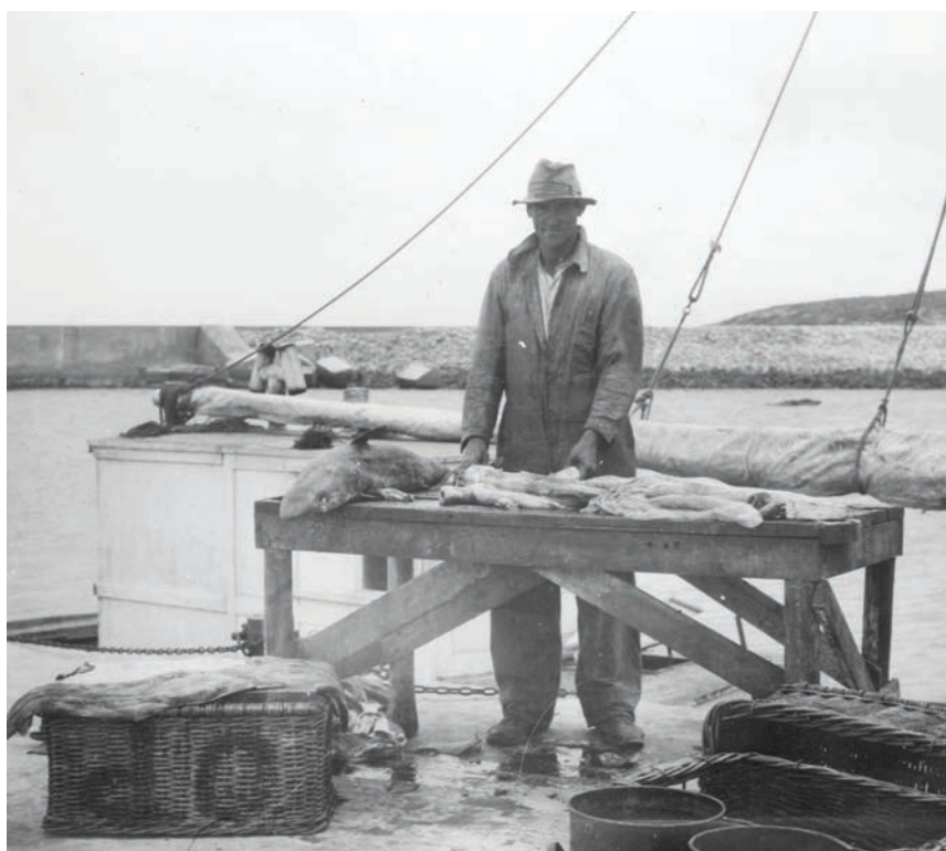
Southern sharks (Galeorhinus galeus) being processed in 1940's for vitamin A (DAFF archival).

Lamberth, S.J., 2006. White sharks and other chondrichthyan interactions with the beach-seine (treknet) fishery in False, Bay, South Africa. African Journal of Marine Science 28, 723-727.